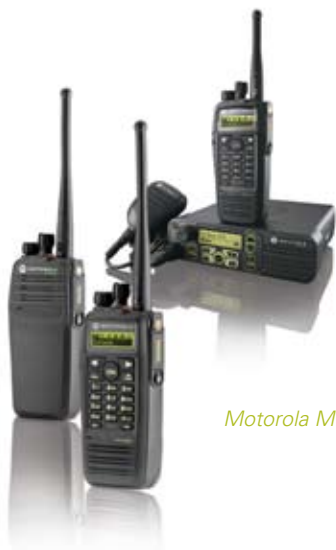
Motorola MOTOTRBO XPR Digital Radios

“When the administrative assistant responded, the audio quality was crystal clear,” he says. “She sounded like she was standing right next to me even though I was underground and she was 12 miles away. To be standing below ground, next to a boiler, and still have that kind of coverage and quality means that the MOTOTRBO radio system works. It’s as simple as that.”