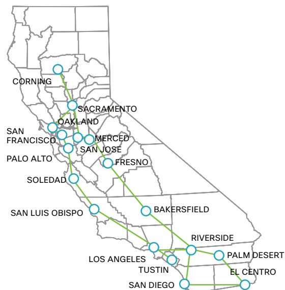
Figure 2. CENIC's CalREN Network Authority

Interconnecting this county-wide infrastructure to CENIC's CalREN infrastructure efficiently extended the reach of the Imperial County network, allowing members of the local network consortium to connect to sites nationally and globally (Figures 2 and 3).