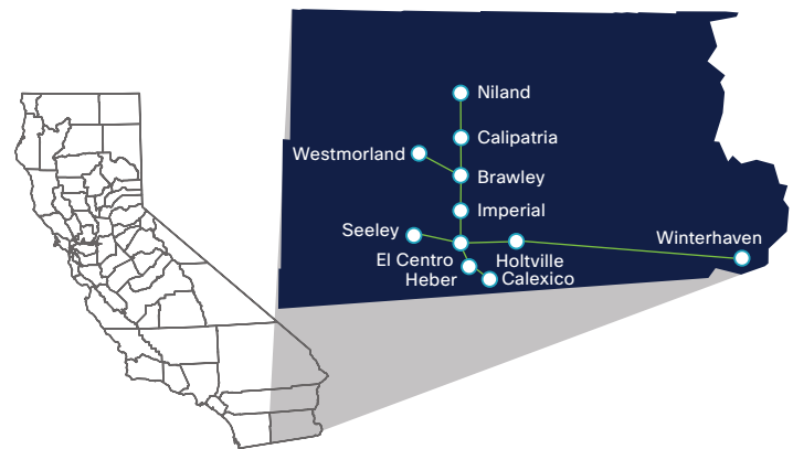
Figure 1. Imperial Valley Telecommunication Authority Infrastructure

The first phase of the IT upgrade consisted of a pilot construction project that connected the Calexico Unified School District office to the local fiber network. The subsequent two phases connected six high schools, three elementary schools, and the Imperial Valley College to the fiber network. Since that time, 68 school sites have been connected to the local network, as have 31 city and county offices, including several public libraries.